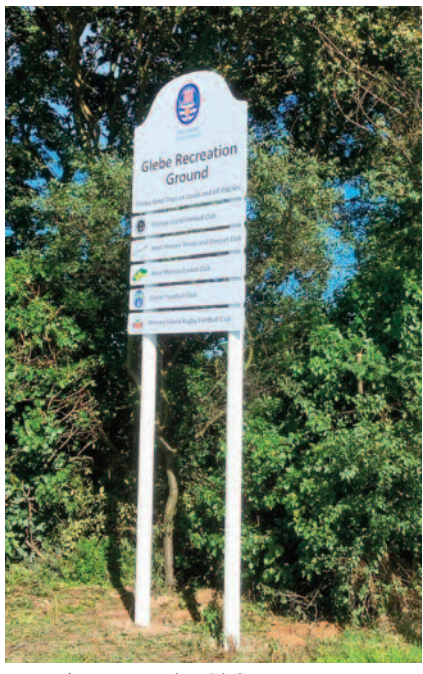
New signage at The Glebe. www.westmersea.org