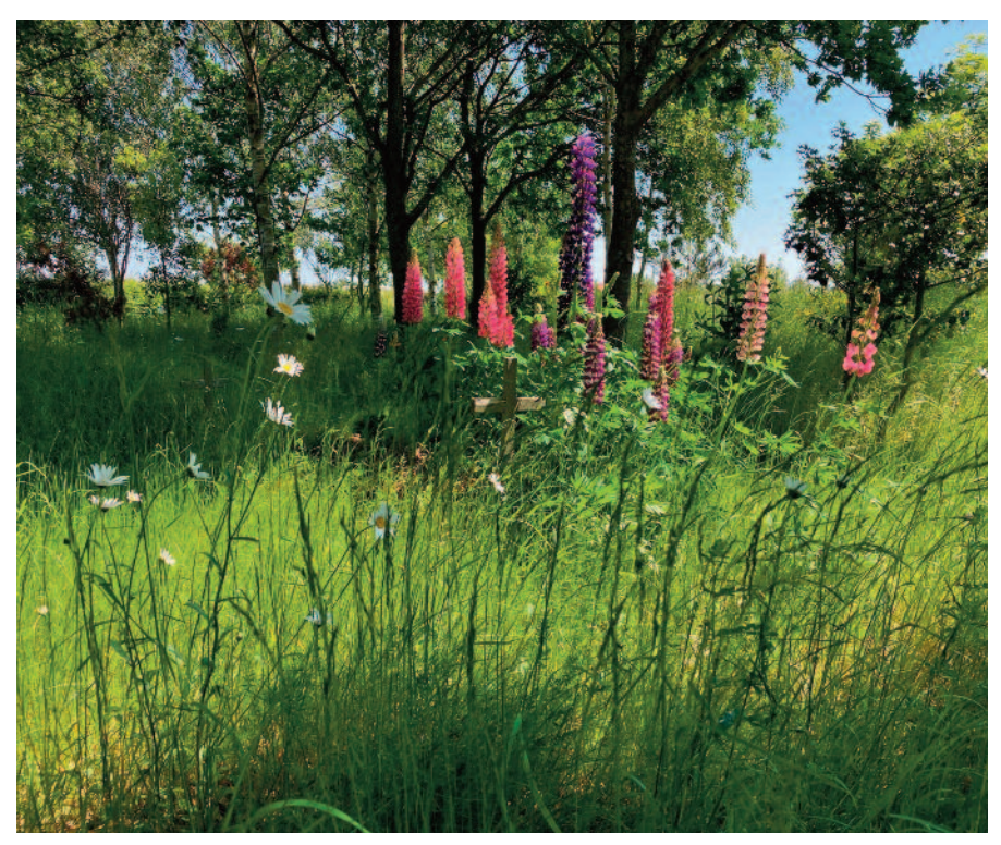
Feldy View Woodland Cemetery.

Further information can be found on the website: www.westmersea.org/Cemetery