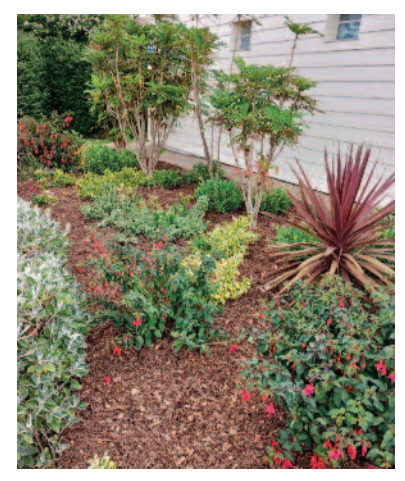
Fairhaven toilets garden.