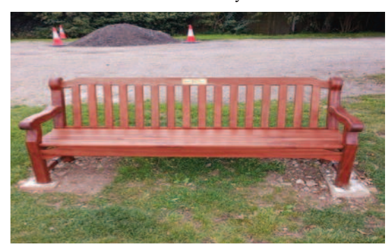
New bench at The Glebe.