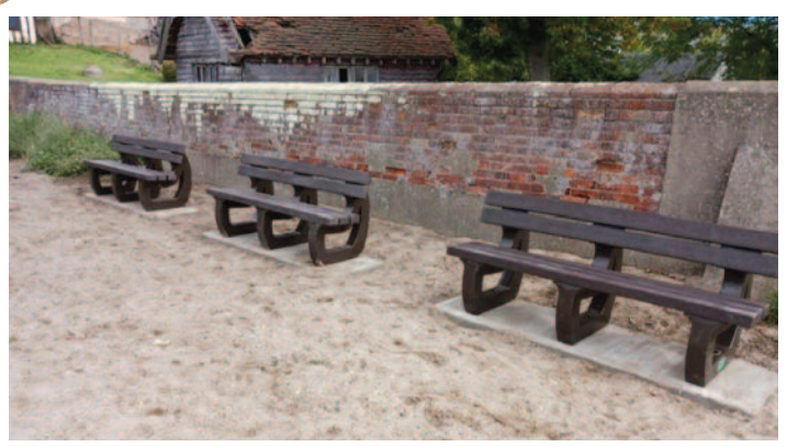
New benches at Monkey Beach.