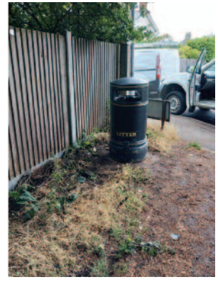
New bin at High Street North.